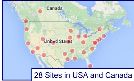
28 Sites in USA and Canada