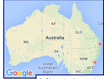
2 Sites in Australia

For each site the following tools are provided: